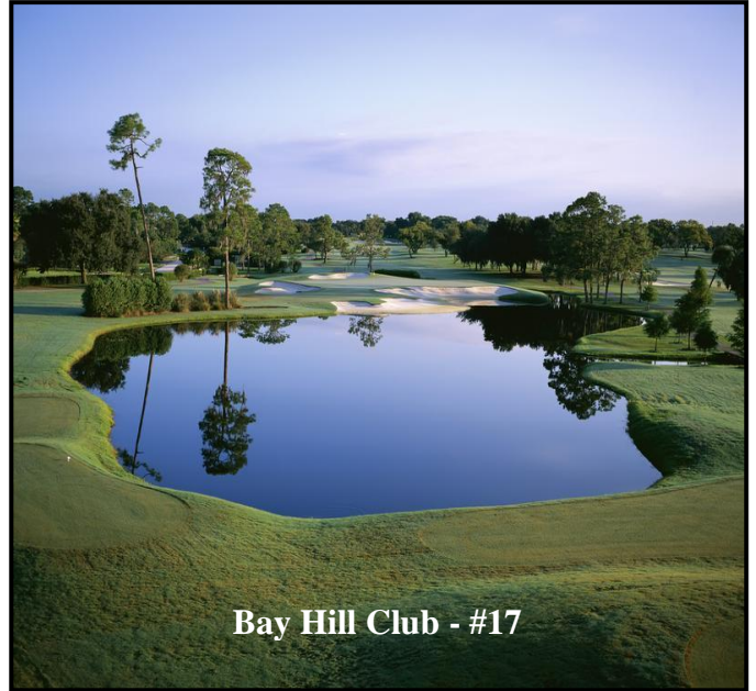
Bay Hill Club - #17

Now, if we have the same hole but we have a bunker that surrounds the green. Meaning the scratch golfer needs 2 shots to reach the center of the green. Then this hole would be rated as a par 4. The key in determining if a hole is a par 4 or par 3 is the scratch golfer's ability to reach the center of the green from the tee.