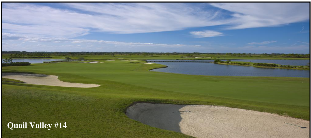
Quail Valley #14

US Open Sectional Qualifying is Monday, June 6 th at Quail Valley Golf Club in Vero Beach. A very impressive list of players will be teeing it up for 36 holes of qualifying with hopes of making their way to Congressional Golf Club in Bethesda, Maryland.